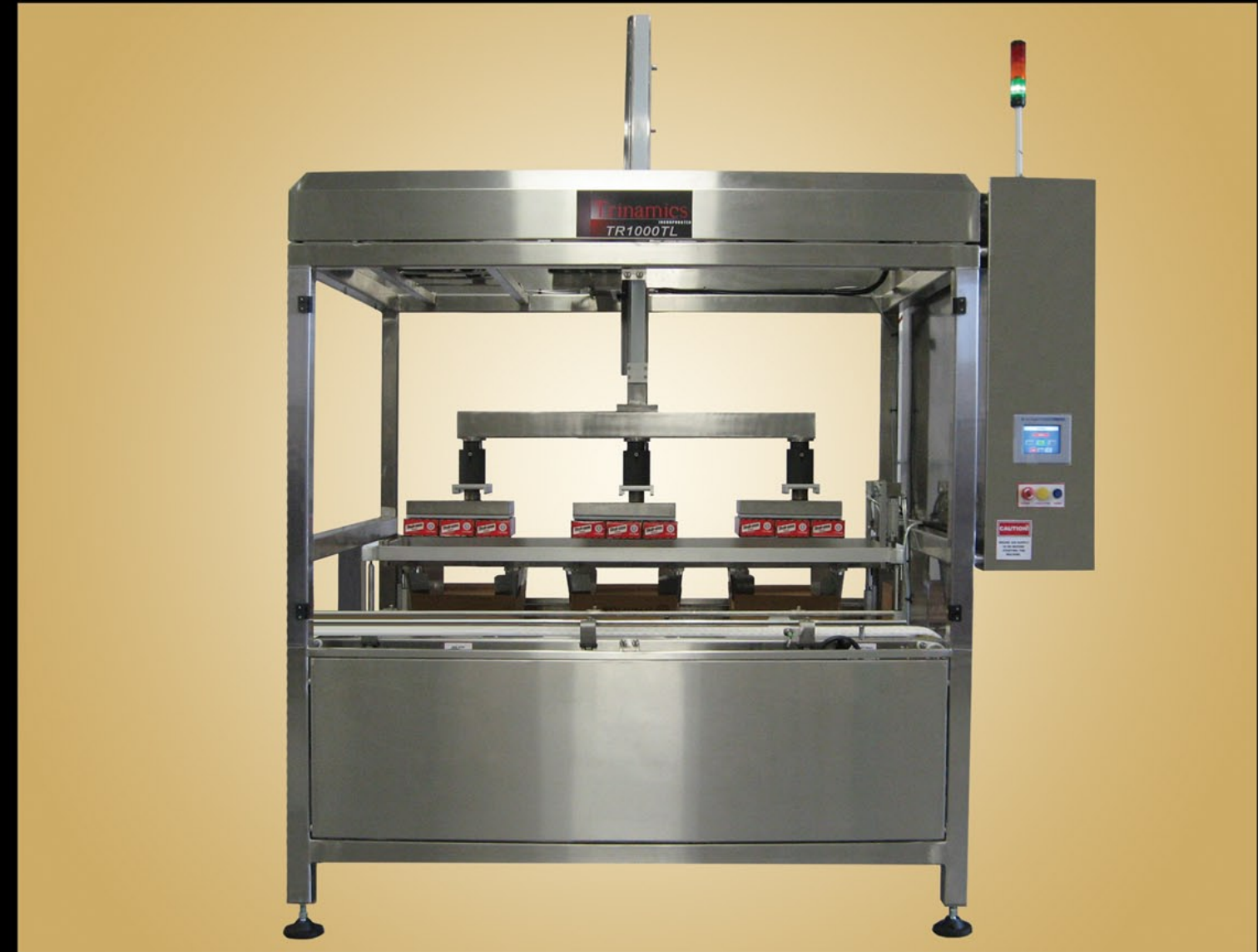
TRE100TL, TR1000TL & TR2000TL

Trinamics Top Load Case Packers provide a tremendous degree of flexibility within a very compact footprint. The user friendly nature facilitates packing a large variety of products across a broad range of applications. Solutions are available for low to high speed requirements.